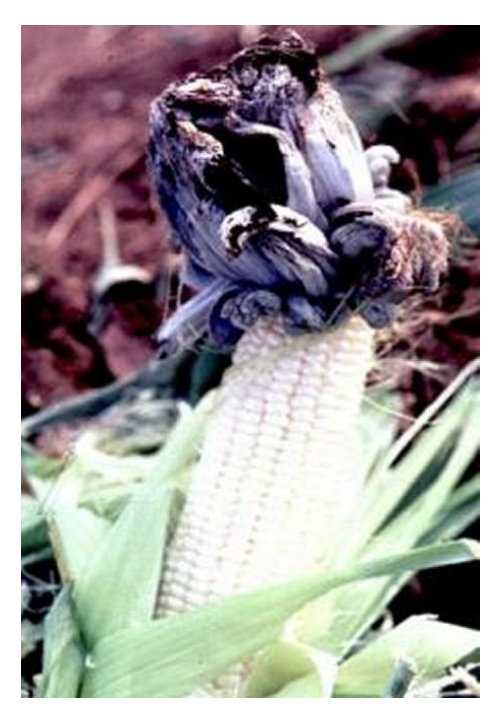
Figure 5. Galls on the ear tip. This differentiates common smut from the head smut disease, which does not allow any kernel development.