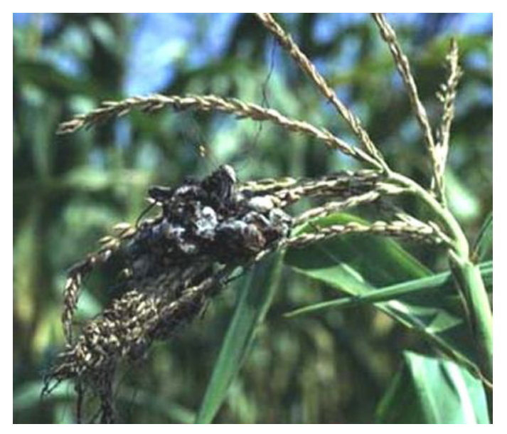
Figure 2. Mature common smut galls on the tassel.

Corn growing in soils with high levels of nitrogen and organic matter, for example barnyard manure, frequently shows more smut than corn growing in soils with a well-balanced fertility. High levels of phosphorus tend to decrease infestation levels of common smut.