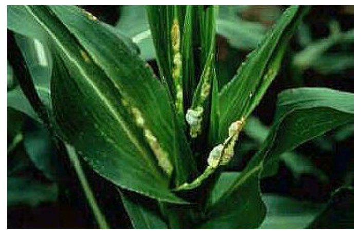
Figure 1. First indication of common smut as leaf infection. Small bumps occur when plants are infected at leaf whorl stage.

Ustilago maydis spores overwinter on corn debris or in the soil and retain viability for a number of years. It is assumed that most traditional corn growing areas in the world have common smut spores present in levels needed for infection if the conditions are favorable.