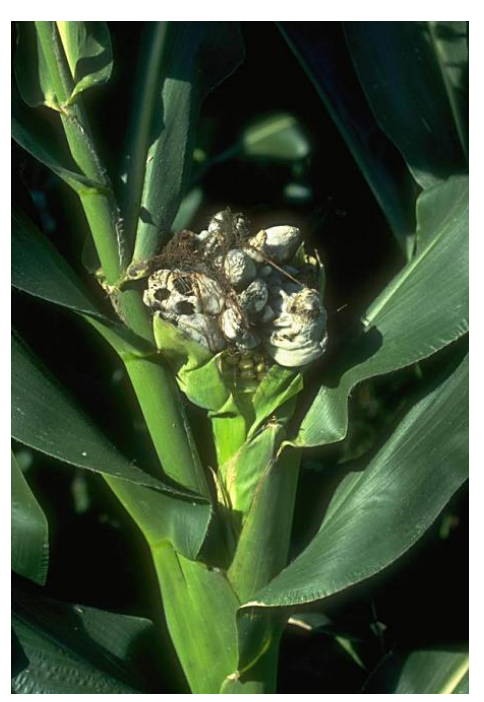
Figure 4. Mature common smut galls on the ear.