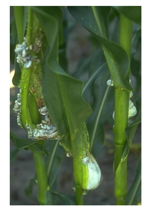
Figure 3. Common smut galls on corn stalks, likely finding an entryway through a wound on the corn plant.