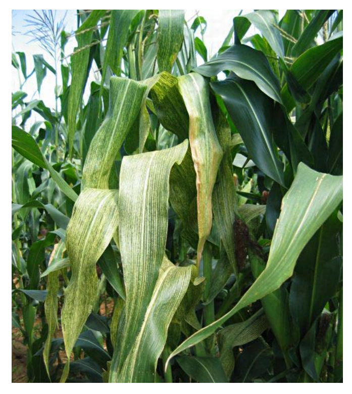
Figure 2 . Maize streak disease symptoms on susceptible maize hybrid in Zimbabwe. Normal-coloured leaves from separate plant in upper right corner.

The leafhopper Cicadulina mbila is the most important insect vector of MSV. This insect is very small, two to four